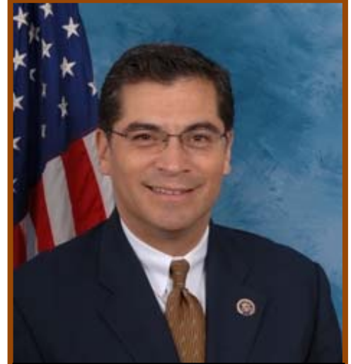
Congressman Xavier Becerra (D-31 st ) (CONFIRMED)