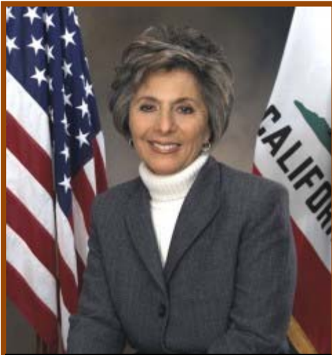
Senator Barbara Boxer (D-CA) (Invited)

Senator Barbara Boxer and House Leadership Congressmen Xavier Becerra and Henry Waxman discuss the commitment in Congress for Immigration Reform